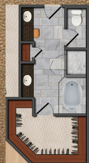
Optional Master Bath Soaking Tub