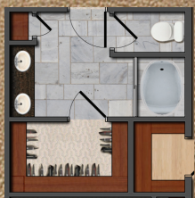
Optional Master Bath Soaking Tub/Shower

Master Bath Soaking Tub/Shower Hardwood Floors in Bedrooms Custom Designed Closet Shelving Upgraded Package Options Additional Parking Garage Space Golf Memberships Available