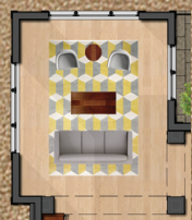
Optional Dining Areas