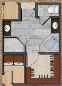
Optional Master Bath Soaking Tub

Master Bath Soaking Tub Hardwood Floors in Bedrooms Custom Designed Closet Shelving Upgraded Package Options Additional Parking Garage Space Golf Memberships Available